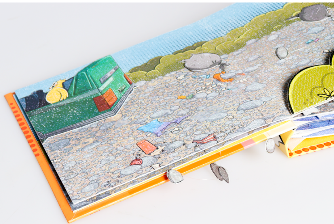
· 碎石 Gravel

Noise earrings: The buttons shake against each other and create a knocking sound. It symbolizes that the manhole covers on the road cause vehicles to make loud noises when they pass by, affecting residents and pedestrians.